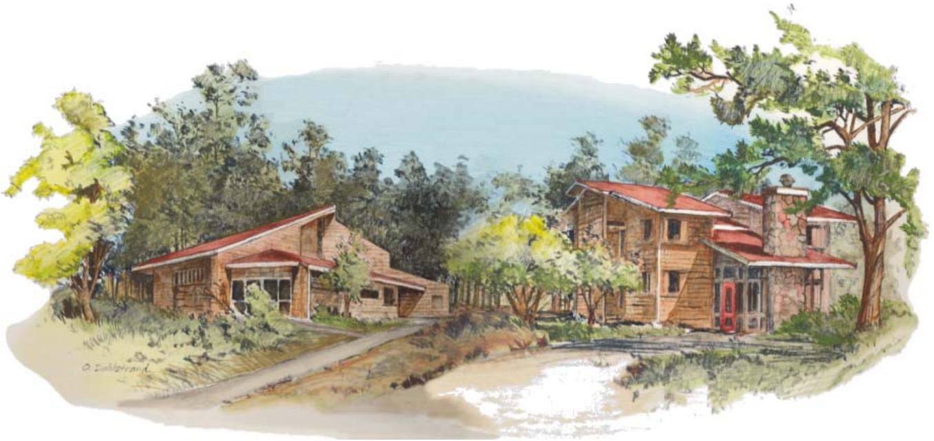
William Penn Mott Jr. Training Center